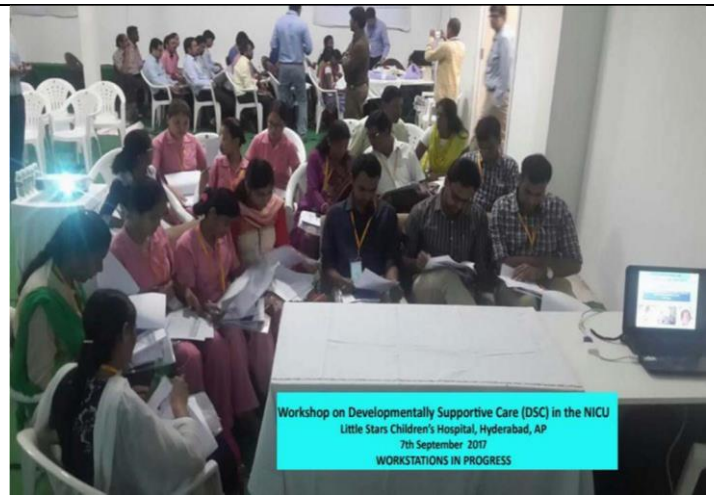
Workshop on Developmentally Supportive Care (DSC) in the NICU Little Stars Children's Hospital, Hyderabad, AP 7th September 2017 WORKSTATIONS IN PROGRESS