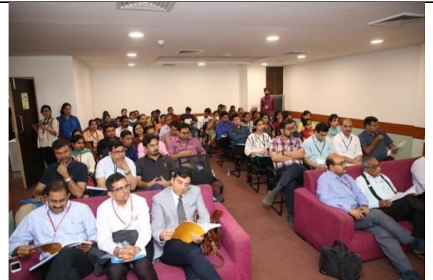
DELEGATES AND AUDIENCE