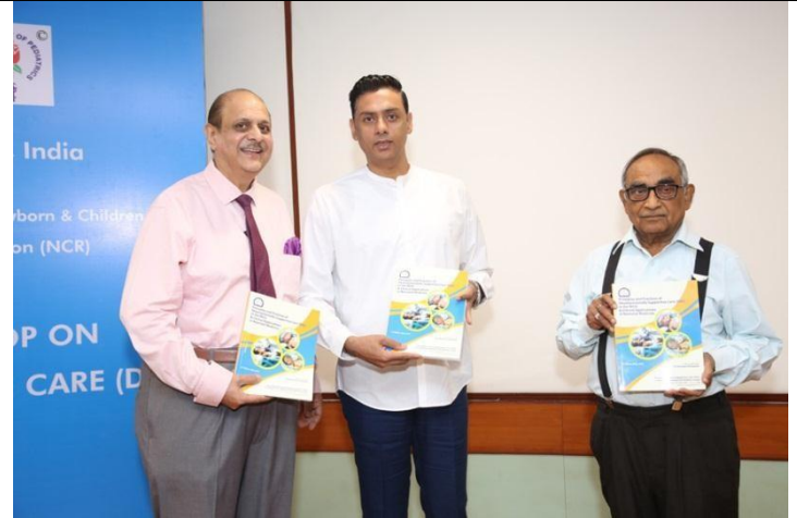
RELEASE OF BOOK - PRINCIPLES AND PRACTICES OF DEVELOPMENTALLY SUPPORTIVE CARE (DSC) IN THE NICU & CLINICAL APPLICATIONS IN NEONATAL MEDICINE – EDITION 2018