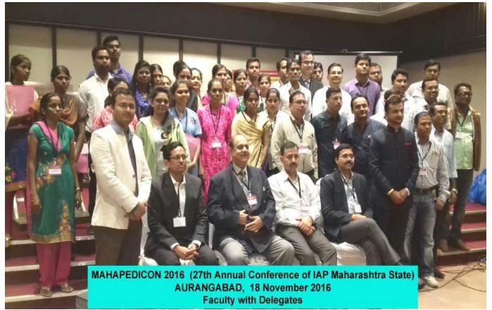
MAHAPEDICON 2016 (27th Annual Conference of IAP Maharashtra State) AURANGABAD, 18 November 2016 Faculty with Delegates