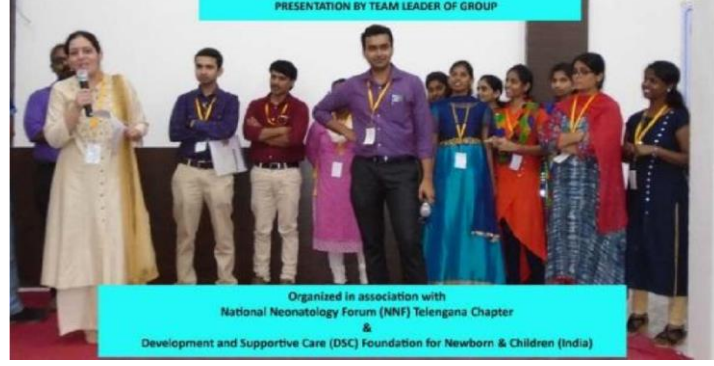
Organized in association with National Neonatology Forum (NNF) Telangana Chapter & Development and Supportive Care (DSC) Foundation for Newborn & Children (India)