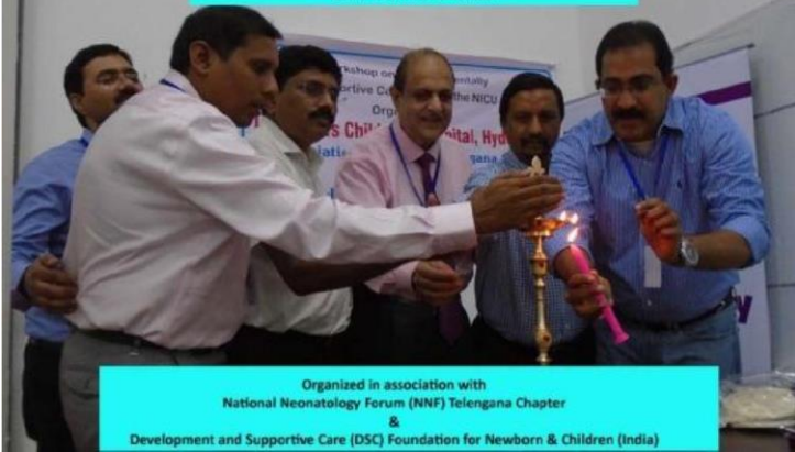
Organized in association with National Neonatology Forum (NNF) Telangana Chapter & Development and Supportive Care (DSC) Foundation for Newborn & Children (India)