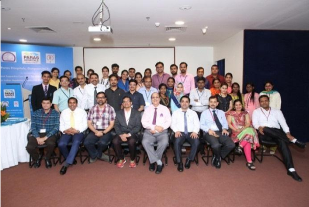
FACULTY & DELEGATES