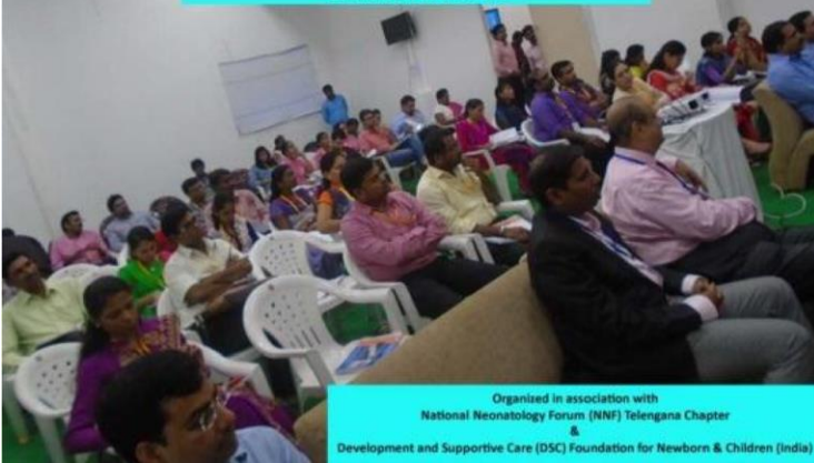
Organized in association with National Neonatology Forum (NNF) Telangana Chapter & Development and Supportive Care (DSC) Foundation for Newborn & Children (India)